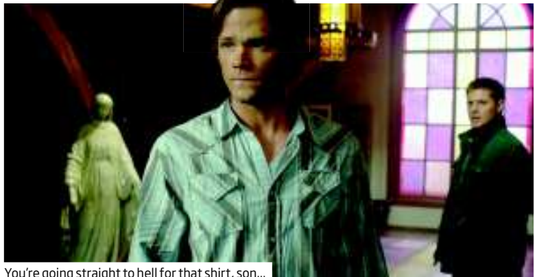
You're going straight to hell for that shirt, son...

It's a relief to see him back, though. Because however daft it seems for the brothers to have spent season three worrying about Dean burning in the lake of fire and trying to find loopholes in the deal he struck, only for him to reappear in the next season premiere, the series wouldn't work if it just centred on a pissed-off Sam instead of a double act. While Dean struggles to cope with his time in Hell, Sam lies about developing his powers and the tension between the two increases, complicated by a twist that reveals something new about their mother. Then there's the usual array of