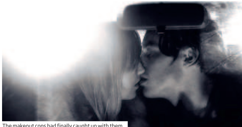
The makeout cops had finally caught up with them.

The premise of two people wandering around a city may sound like Before Sunrise all over again, but Midnight Kiss is something else - a beautiful, touching film full of